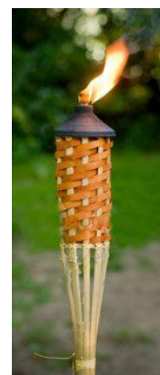
Tiki lights are available at most pound shops or hardware stores.