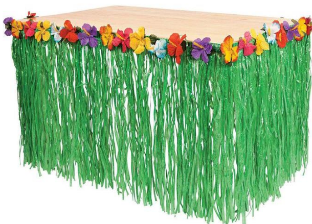
Give your tables a more festive touch by adding grass skirts and flowers (thin strips of green plastic bags and flowers from any pound shop).