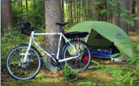
Cycle camping - tents on bikes