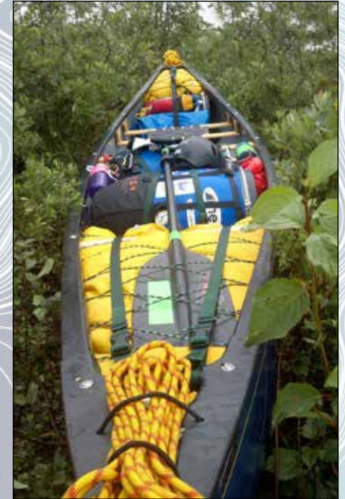
Canoe Camping - exploring a waterway