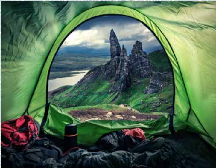
Wild Camping - pitching your tent in a wild open space