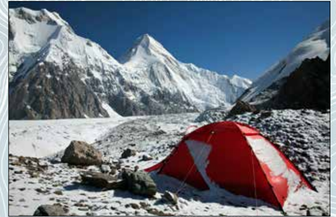
Winter camping - in the snow, tents and snow holes