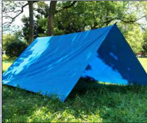
Backwoods camping - survival shelters