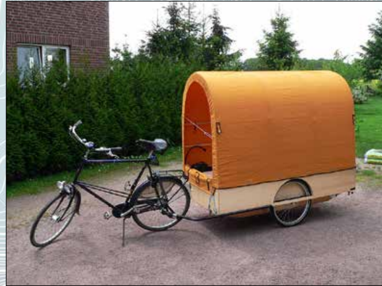
Shelter camping - a little bit of comfort