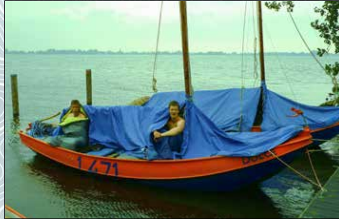
Sail camping - exploring a lake, island or seashore