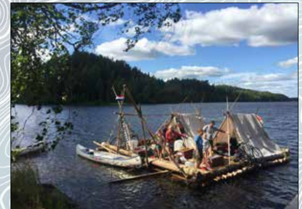
Raft Camping - a night on the water.