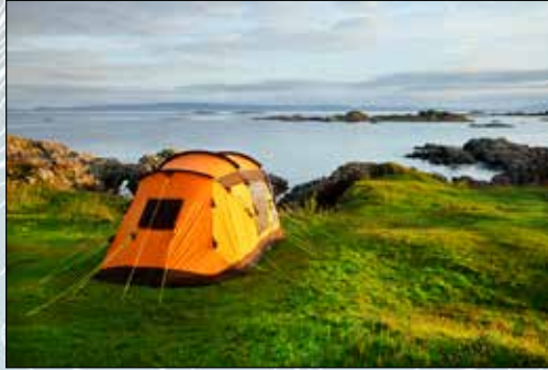
Lightweight camping - a new place every night!