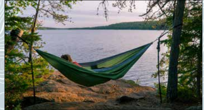
Hammock Camping - slumber in the trees