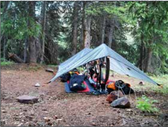
Bivouacking in the woods - back to basics